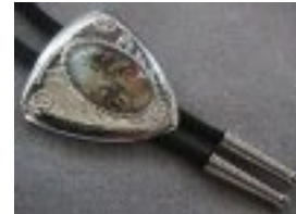
BOLO TIE Wear this tie to your "goat meeting" or to the office. #3994T . . . $8.00