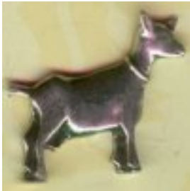
PEWTER SCATTER PIN "Danforth" Pewter pin comes with gift card. Measures 3/4" #674 . . . $5.95