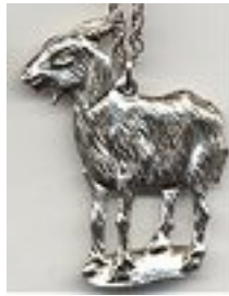
POLISHED SILVER PEWTER PENDANT & CHAIN #4397 . . . $9.00