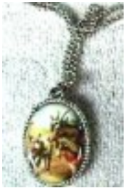
NECKLACE 24" chain with goat emblem. Very attractive for any age person. Silver finish. #4001 . . . $5.00