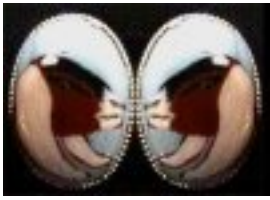
POST EARRINGS with silver edging (Nubian heads are shown) #7087 . . . $10.00