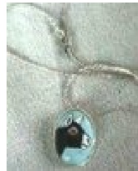
NECKLACE - OVAL SHAPED PENDANT, edged in silver with 18" silver chain (Pygmy head is shown). #7085 . . . $10.00