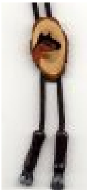
BOLO TIE - ends are "goat hooves" (Oberhasli head is shown). #7086 . . . $10.00