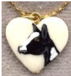
NECKLACE - HEART SHAPED PENDANT, 18" gold chain (Nigerian head is shown). #7084 . . . $10.00