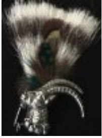
PEWTER HAT PIN with buck deer tail brush and feather, from Germany. Measures 4" #849 . . . $17.75