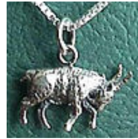
WILDTHINGS DESIGNER JEWELRY Sterling silver pendant to match earrings. #8161 . . . $10.00