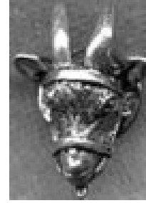
PEWTER LAPEL PIN OR TIE TACK #2895 . . . $5.00