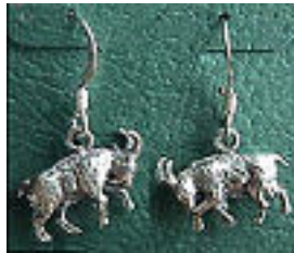
WILDTHINGS DESIGNER JEWELRY Sterling silver earrings #8160 . . . $12.00