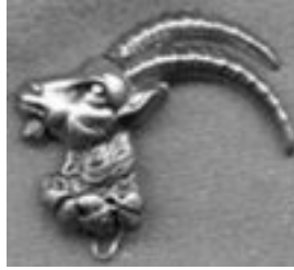
PEWTER PIN Same as hat pin at left except without deer hair and feathers. Measures 1.5" x 1" #848 . . . $6.50