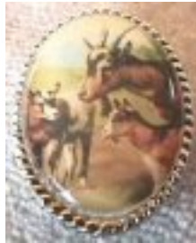
LAPEL PIN OR TIE TACK Goat picture framed in silver edging. Measures 1" x 3/4" #3994P . . . $4.00